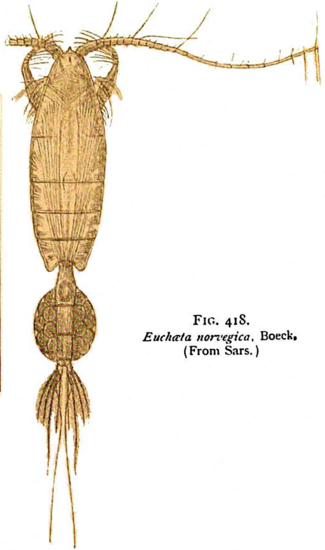
FIG. 418. Euchæta norvegica , Boeck, (From Sars.)

larges its surface, while in cold water the horns are much more slender, the lower specific gravity caused by the higher temperature rendering floating appliances necessary for both animals and plants (see also Chapter X.).