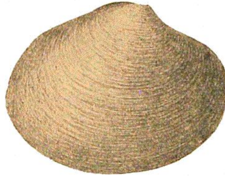
FIG. 375. Tridonta borealis , Chemn. (After G. O. Sars.)

Occasionally too we find in far more southern areas a few forms that must be considered purely arctic, although they are quite acclimatised and plentiful. They are survivals (relicts), and date from the glacial age when the northern seas were inhabited by an arctic fauna. The milder climate which succeeded the glacial period brought about the elimination of all those species that are now purely arctic, and such forms are at present practically limited to arctic tracts. Only a few were able to adapt themselves to the altered conditions, 1 and are to be found to this day