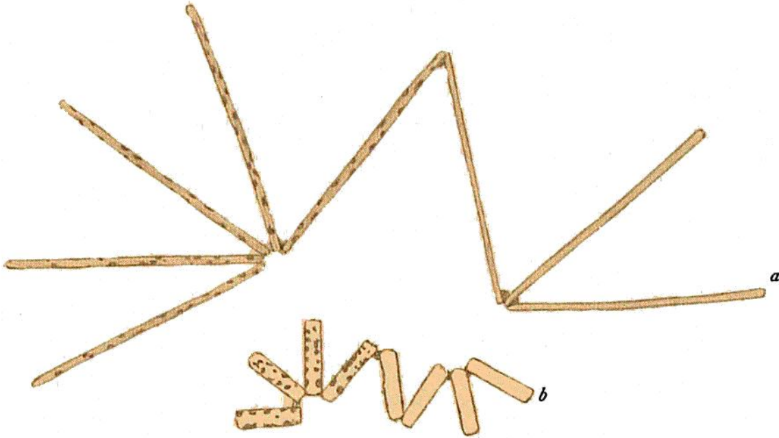
FIG. 220.—COLONIES OF THALASSIOTHRIX NITZSCHIOIDES (899). a , With long cells shortly after auxospore formation ; b , with shorter and thicker cells.

their cells diminishing by being divided and increasing again owing to the formation of auxospores (see Fig. 220), it is