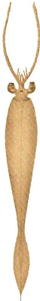
FIG. 442. Toxuma belone , Chun. About nat. size. (From Chun.)