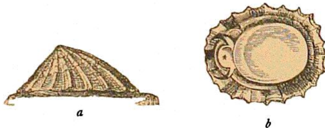
FIG. 317. Patella vulgata , L. a. From the side; b. from beneath.

four species of gasteropods, which are very characteristic of this area, namely, the limpet ( Patella vulgata , see Fig. 317), two periwinkles ( Littorina