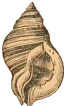
FIG. 319. Purpura lapillus , L.

littorea , see Fig. 318, and L. rudis ), and the purple snail ( Purpura lapillus , see Fig. 319), this last being often plentiful in the barnacle-belt, where it feeds on these crustaceans. These forms live chiefly on the naked rock, but, except the limpets, also often on the algæ in the tidal area. But when the belt of fucoids is exposed at ebb-tide, especially in sheltered places where a good current runs, we see that the algæ, the species of Fucus in particular, have their special fauna, consisting chiefly of attached forms. The majority of them are hydroids, the commonest species being Dynamena pumila (see Fig. 320),