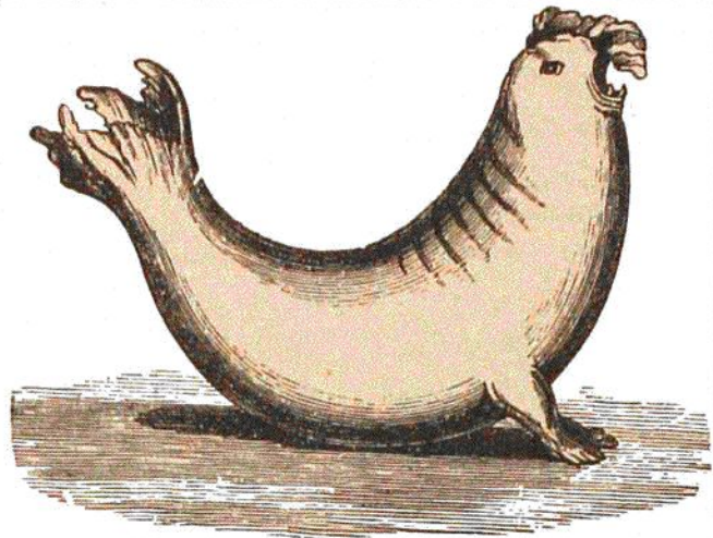
OLD MALE SEA-ELEPHANT OF JUAN FERNANDEZ (Copied from Anson's Voyages.)

intermuscular ridge or crest, and the bones around the nostrils are very strong . In these points the Elephant is very different from the Fur-Seal. The beast raised itself on its fore-flippers, and at the same time twisted up its tail into the air, just as represented in "Anson's Voyages," where the Sea-Elephant was figured for the first time as the Sea-Lion of Juan Fernandez.