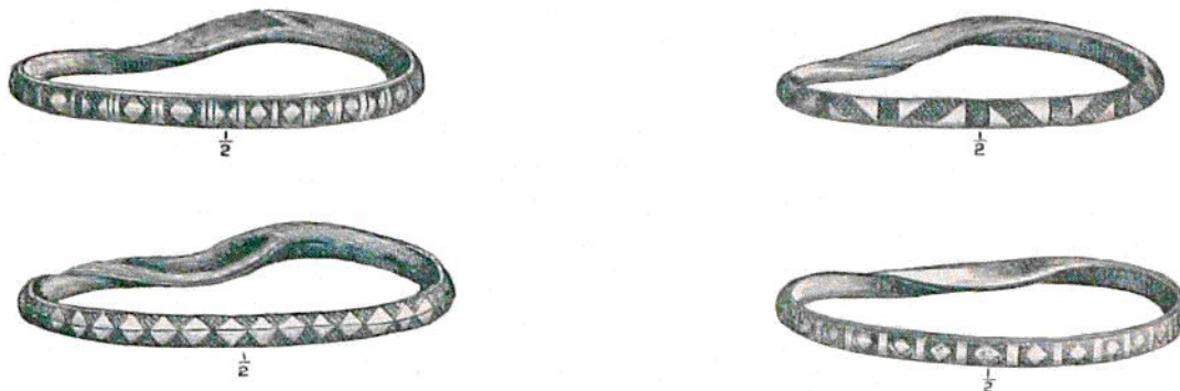
FIG. 239.—Four Armlets, consisting of horizontal sections of Trochus niloticus shells, engraved with various patterns, from the Admiralty Islands.

The men wear armlets (often seven or eight on each arm) of Trochus niloticus shell, like those of Fiji, the Carolines, and elsewhere. The rings are neatly engraved with lines forming patterns composed of lozenges, triangles, and transverse bars, the raised lines being blackened so as to form a dark background against which the lozenges show