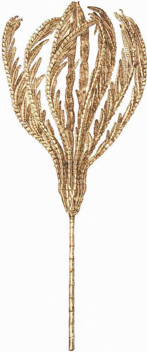
FIG. 120.— Bathycrinus complanatus , WYV. THOMS., M.S.

upper surfaces of these are articulated the third radials or axillaries, but by ligaments only and without the intervention of muscles. Each axillary bears two arms, so that