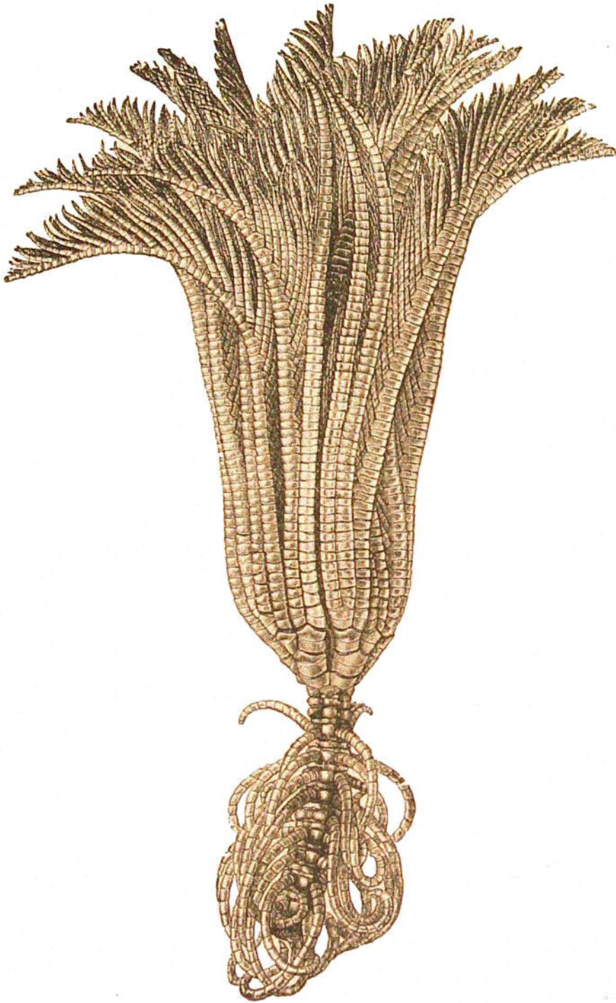
FIG. 116.— Pentacrinus maclearanus , Wyv. Thoms.

calcareous deposit. This is the case with the individuals represented in figs. 116 and 117, and it would seem that under these circumstances the animal practically becomes a free